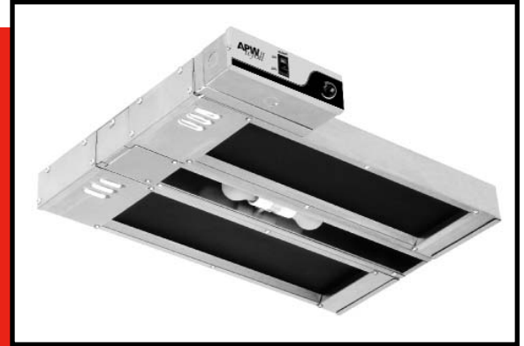
RADIANT*BLACK™ DOUBLE OVERHEADS